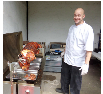
Above Maypole dancing—and getting ready to carve the joint. The Hills Hog Roast was held at The Foresters Arms, Baldwins Hill.