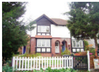
30 York Hill