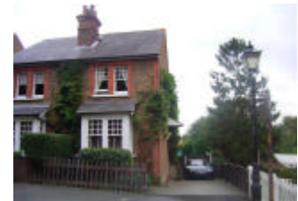
79 York Hill