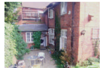
7 York Hill

Dryads Hall Woodbury Hill (detached freehold) £2,158,000 (Jun).