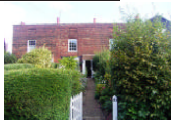
113 York Hill