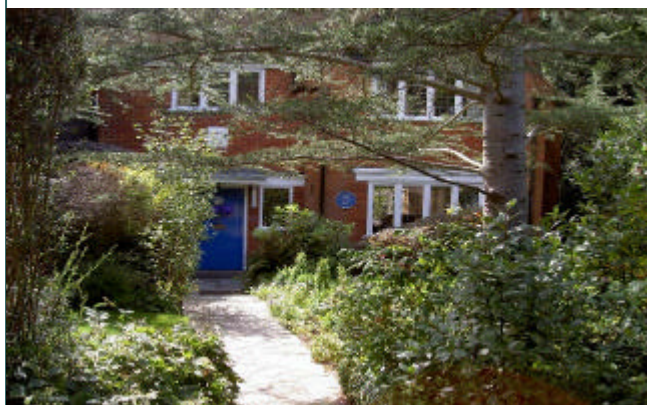
Sunnybank, 9 Woodbury—home of famous hymns