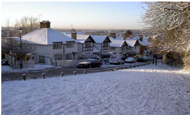
A wintry view from the top of York Hill, Canary Wharf lost in the haze.

Tel: 0208 502 2370; E mail: Petetid@yahoo.com