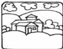
Hills Amenity Society