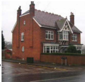
The landmark property would go for new flat block.

In a letter to the council the Hills committee states: “The building scheduled for demolition has been a landmark building in Loughton for many many years. We feel that to replace this building with modern flats would be totally out of character for the area. These flats would have a detrimental effect on adjacent properties.”