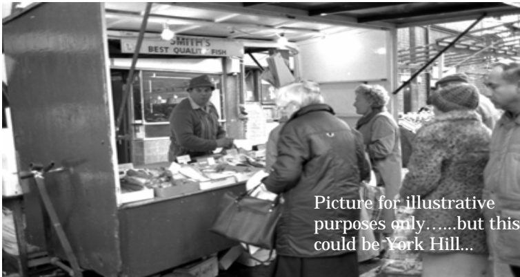
Picture for illustrative purposes only.....but this could be York Hill...

While some will no doubt welcome a visit to York Hill, Loughton, "of a Sunday", residents may be less pleased at the new "eating opportunity which has sprung up in the beer garden opposite the once-select Wheatsheaf public house. According to the Hills Amenity Society, this new "amenity" has not received planning permission. The Hills committee believes that permission is required...and is investigating.