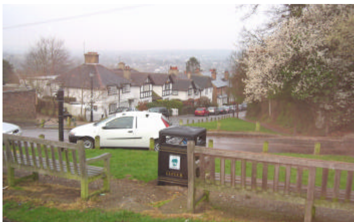
A damp spring morning and the new litterbin with arguably the best view in Loughton at the top of York Hill. But will EFDC empty it.....?

Working to protect and enhance the Conservation Areas in which we live