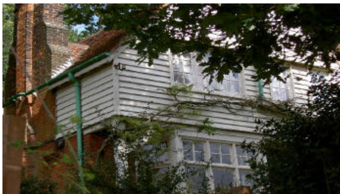
Southbank, York Hill: Loughton Town Council ‘did not listen to local views’

The Town Council is not the final arbiter but its views tend to hold sway at District Council level. In most cases Epping Forest District Council is the decision-maker, giving it a duty to take into account all views, including those of the Town Council. But unmistakably it is the views of the Town Council which increasingly hold sway when the District Council makes its decision.