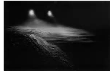
Dark streets bring dangers: Council may be listening